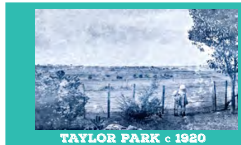
TAYLOR PARK c 1920